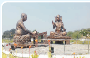
Sant Dnyaneshwar birth place - 40 Kms-Newasa