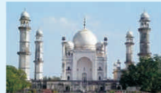
Bibi ka Makbara