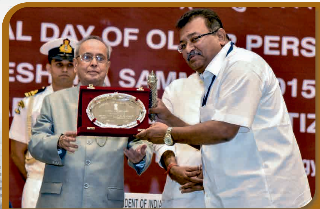
"Vayoshrestha Samman (National Award)-2015" Under Institutional Category For Best Institution for providing services to senior Citizens & Awareness Generation received on 01st October, 2015 at Vigyan Bhawan, New Delhi.

from His Excellency the President of India Hon'ble Shri Pranab Mukharjee