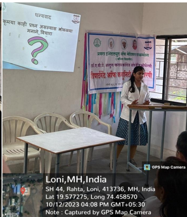
Loni, MH, India SH 44, Rahta, Loni, 413736, MH, India Lat 19.577275, Long 74.458570 10/12/2023 04:08 PM GMT+05:30 Note : Captured by GPS Map Camera