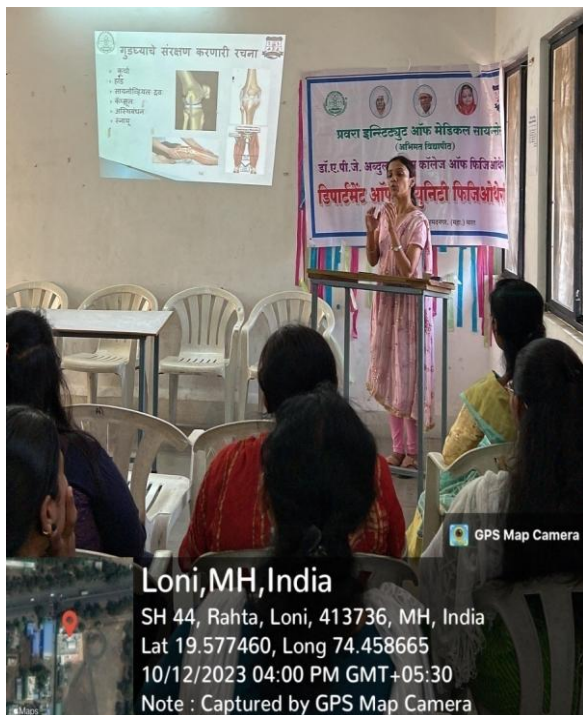
Loni, MH, India SH 44, Rahta, Loni, 413736, MH, India Lat 19.577460, Long 74.458665 10/12/2023 04:00 PM GMT+05:30 Note : Captured by GPS Map Camera