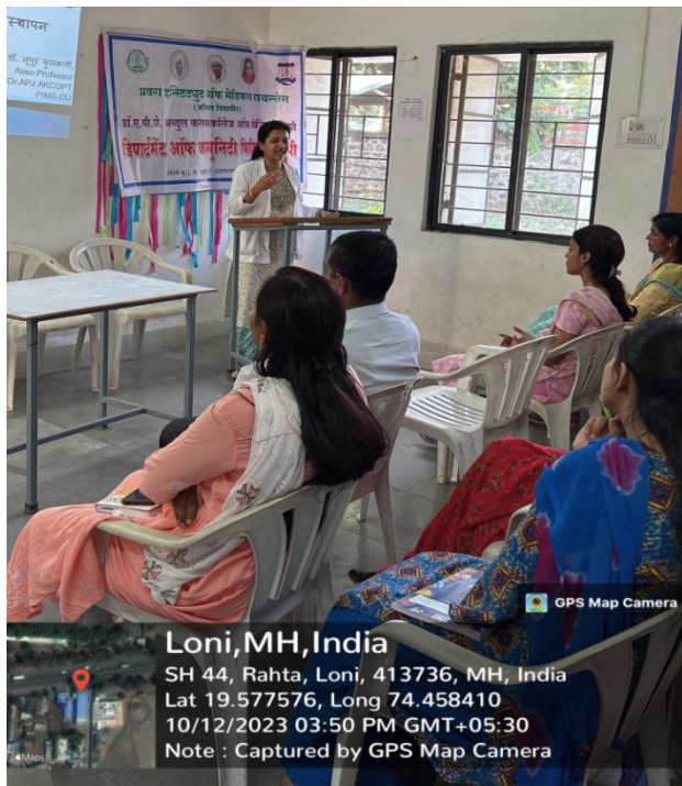
Loni, MH, India SH 44, Rahta, Loni, 413736, MH, India Lat 19.577576, Long 74.458410 10/12/2023 03:50 PM GMT+05:30