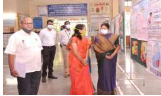
Poster and Slogan writing competition