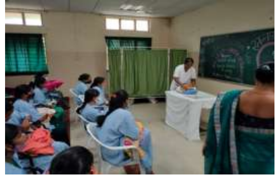
Positioning of babies while Breast Feeding