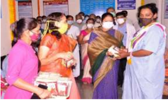
Protein Powder Packets Distribution