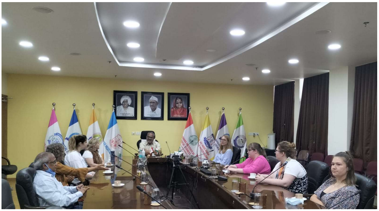
Student and faculty from University of Worcester visit Hon'ble Vice Chancellor Sir