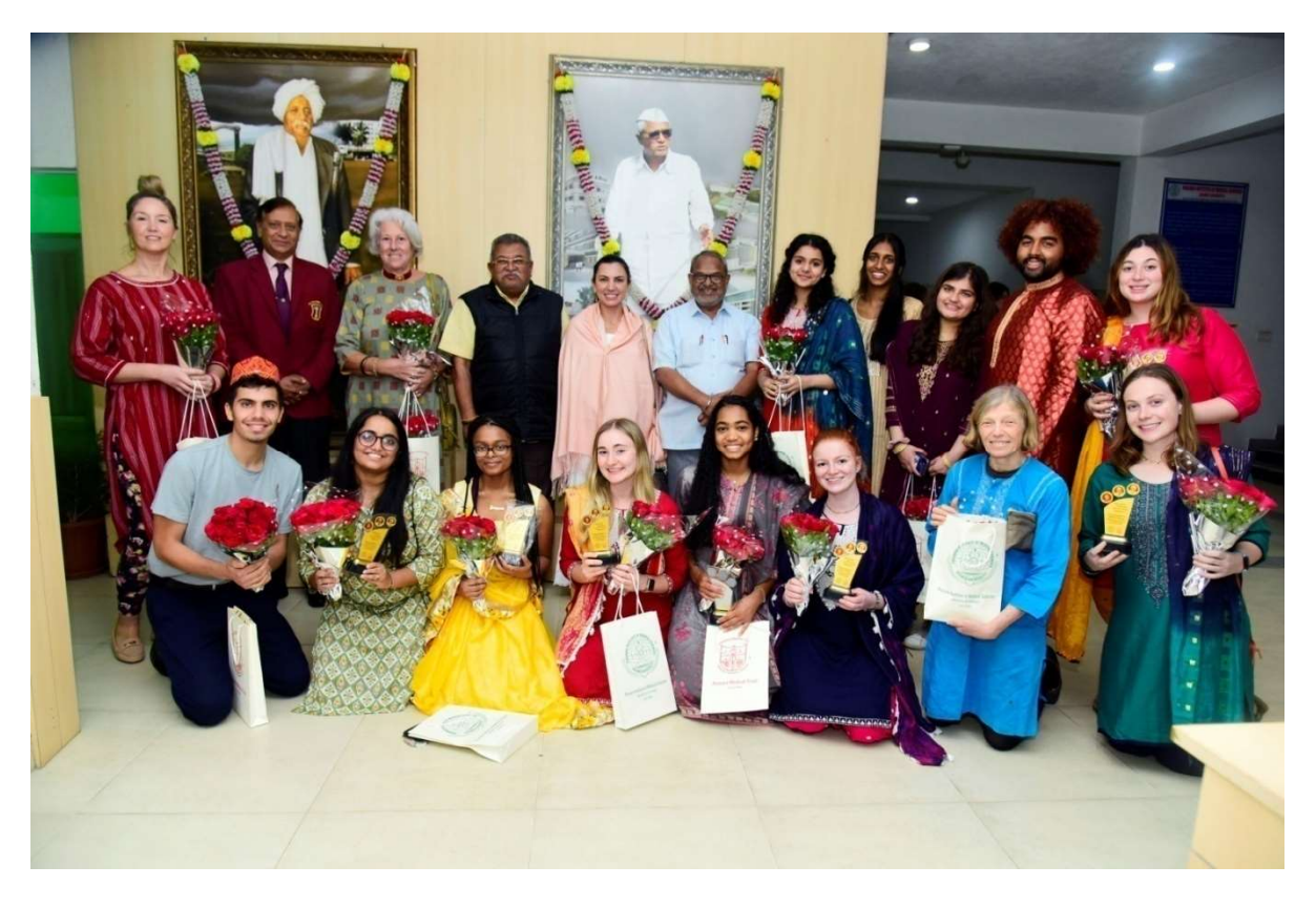
Hon'ble Chancellor & Vice Chancellor with students and faculty from The College of New Jersey, USA Jan 2023