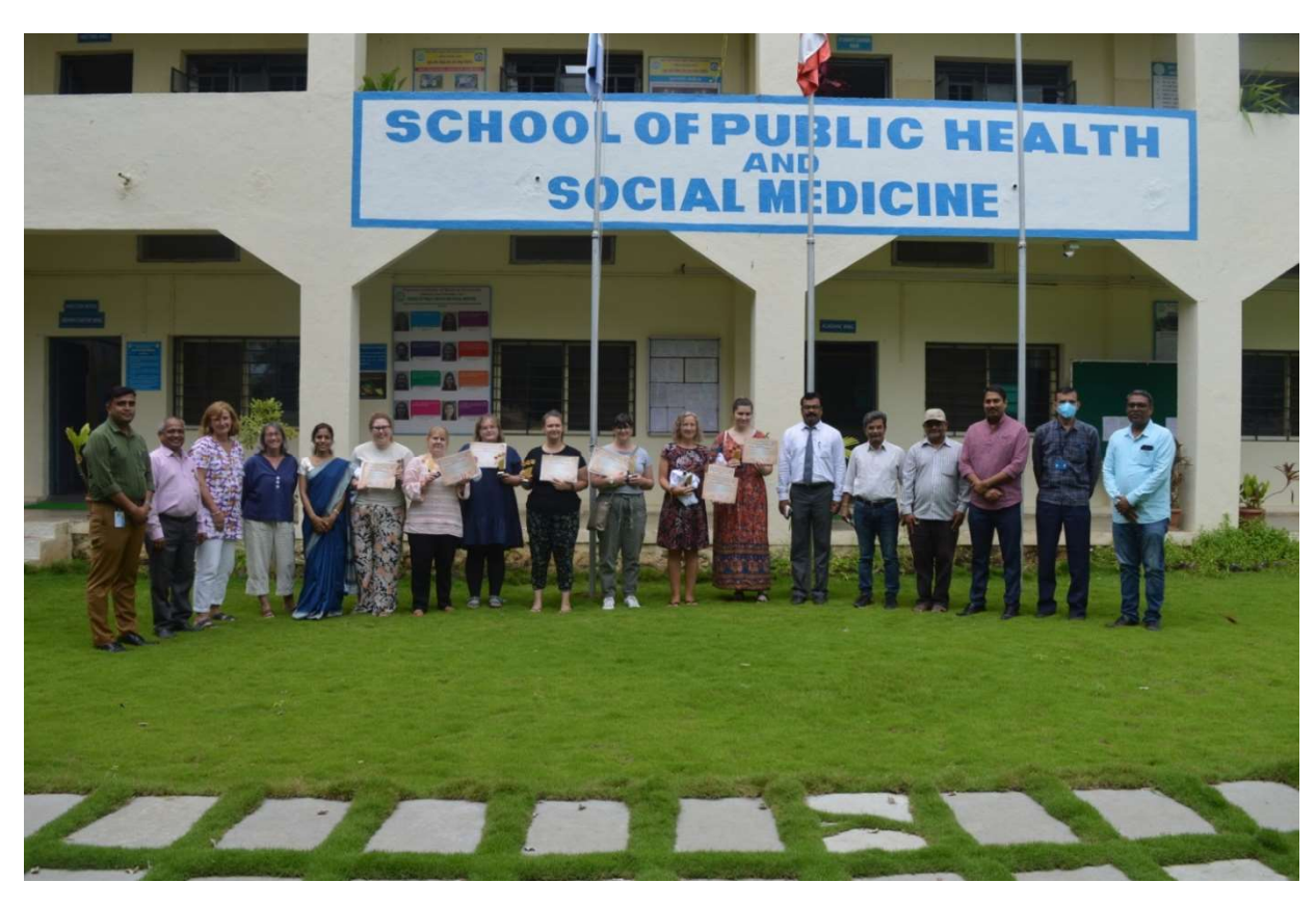
Student from University of Worcester, UK complete the Certificate Course at School of Public Health and Social Medicine, PIMS - DU