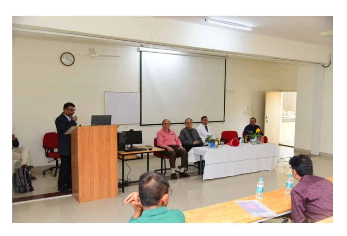
"Workshop on Interpretation of Digital Pathology Slides"